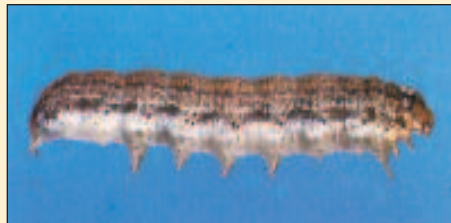
Darksided Cutworm Larva